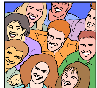
392 residents from Morrow County completed the Strengths and Issues survey!